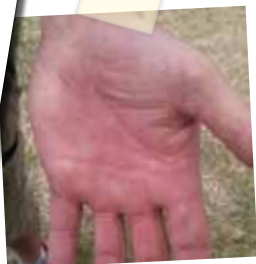
June 2014 - After