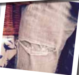
Patch your jeans